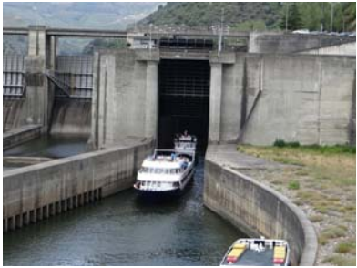
Barragem do Bagaúste

This trip is recommended for people who appreciate history and wine. Minimal walking is necessary.