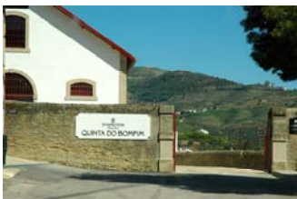
Quinta do Bomfim

Before crossing the bridge over the Douro River into Pinhao, stop to take in the scenery. When you first cross the bridge, take an immediate right to Symington's Quinta