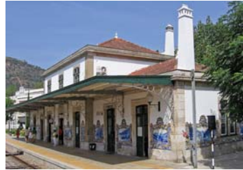
Pinhao Train Station

The train station in Pinhao is famous for its tiles (azulejos). You may be able to partake of a wine tasting at the train station but if you would appreciate more adventure, you may choose other options.