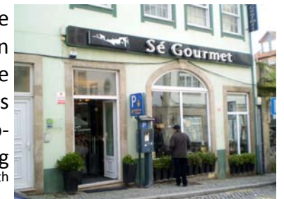
Wine shop in Lamego

Nossa Senhora dos Remedios. There is another, similar and possibly more famous stairway church near Braga called Bom Jesus do Monte. Another notable church in Lamego is the Se which has some components dating back to the 12 th century. The wine shop behind the Se sells excellent Portuguese wines and other goods such as cork purses.