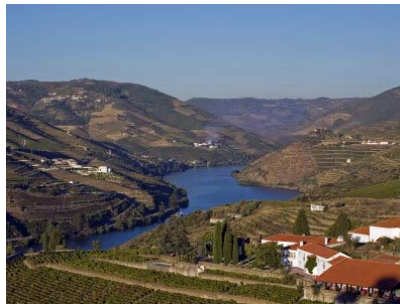
View from Quinta Nova

If you travel west along a curvy road on the north side of the Douro approximately 10 kilometers you will arrive at Quinta Nova de Nossa Senhora do Carmo. The view here is stunning and you can take many wonderful photographs of possibly the most beautiful wine growing region in the world. The Douro Port and red table wines of Quinta Nova de Nossa Senhora are very good and can be tasted and purchased on site.