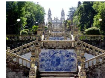
Stairway to Nossa Senhora dos Remedios

called LBV 79 which is located near the river at Lugar de Praia. Or you might choose to head back on the N222 toward Peso da Régua, stopping in Folgosa for lunch. The DOC restaurant in Folgosa on the south bank of the Douro is one of the restaurants operated by Rui Paula, a well-known Portuguese chef.