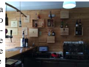
Aldeia Douro Wine Bar

Nova de Foz Côa called Aldeia Douro which has more complex fare than the usual Portuguese home-cooking. Foz Caffè is a good choice for traditional cuisine and is located on the main road between the town center and the IP2.