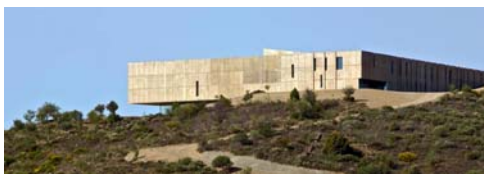
Foz Côa Museu

Allow at least 1 1/2 hours to arrive at the museum from Quinta dos Tres Rios. Leave the Quinta no later than 8:15am to arrive in Vila Nova de Foz Côa by 9:45 am. The Museu is situated several kilometers east of town and you will need to place close attention to the somewhat abundant signage which takes you through neighborhoods and eventually down a paved road which has rock walls on both sides.