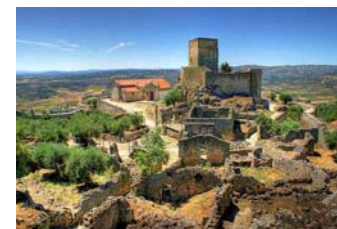
Castle at Marialva

You can also visit one of the many castles in the area. The ruins of Castelo Melhor lie past the Museum on the east side of the Côa River valley. Another good choice is Marialva which